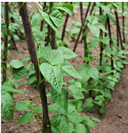
Pole beans grow high and produce a big harvest!